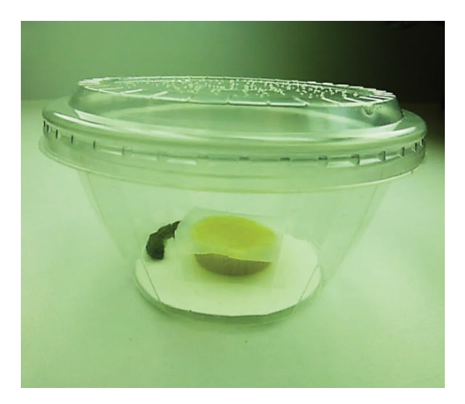
Fig. 3. Polar Plastic Ltd. cup (240 ml) used to rear individual caterpillars (in this picture: Euxoa auxiliaris ).

The diet was prepared as per the recipe provided to us by Insect Production Services, which corresponds to that of Grisdale's (1973) modification of the recipe developed by McMorran (1965). Ingredients for 2-liter diet: 1,720 ml distilled water, 34.72 g agar, 70 g casein, 70 g sucrose, 61.39 g toasted wheat germ, 20 g Wesson's salt, 10 ml 4 M KOH, 10 ml linseed oil, 10 ml alphacel, 8 g ascorbic acid, 4.2 g aureomycin, 3 g methyl paraben, 2 g choline chloride, 1 ml 37% formalin, 20 ml vitamin solution. Ingredients for 2 l vitamin solution: 2 l water, 2 g nicotinic acid, 2 g calcium pantothenate, 2 g riboflavin, 0.5 g thiamine hydrochloride, 0.5 g pyridoxine hydrochloride, 0.5 g folic acid, 0.04 g biotin, and 0.004 g vitamin B12. To better preserve the vitamins, we replaced 200 ml (for 2 l of diet) of water by 200 g of crushed ice, which was blended with the hot mixture in a blender for one minute just before adding the vitamin solution in order to reduce temperature of the mixture. When the diet