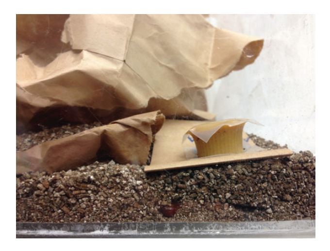
Fig. 2. Set up for rearing cannibalistic species in cages. This picture shows a corner of a 60 by 47 by 44 cm Plexiglas cage used to rear 50 Mamestra configurata larvae (pupa visible in vermiculite). Three caterpillars died of disease, the others pupated but none were cannibalized.

The diet was prepared as per the recipe provided to us by Insect Production Services, which corresponds to that of Grisdale's (1973) modification of the recipe developed by McMorran (1965). Ingredients for 2-liter diet: 1,720 ml distilled water, 34.72 g agar, 70 g casein, 70 g sucrose, 61.39 g toasted wheat germ, 20 g Wesson's salt, 10 ml 4 M KOH, 10 ml linseed oil, 10 ml alphacel, 8 g ascorbic acid, 4.2 g aureomycin, 3 g methyl paraben, 2 g choline chloride, 1 ml 37% formalin, 20 ml vitamin solution. Ingredients for 2 l vitamin solution: 2 l water, 2 g nicotinic acid, 2 g calcium pantothenate, 2 g riboflavin, 0.5 g thiamine hydrochloride, 0.5 g pyridoxine hydrochloride, 0.5 g folic acid, 0.04 g biotin, and 0.004 g vitamin B12. To better preserve the vitamins, we replaced 200 ml (for 2 l of diet) of water by 200 g of crushed ice, which was blended with the hot mixture in a blender for one minute just before adding the vitamin solution in order to reduce temperature of the mixture. When the diet